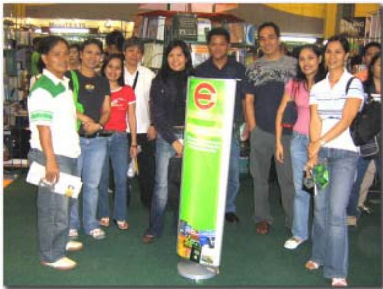
Book lovers. DLSU-D faculty during the 28th Manila International Book Fair